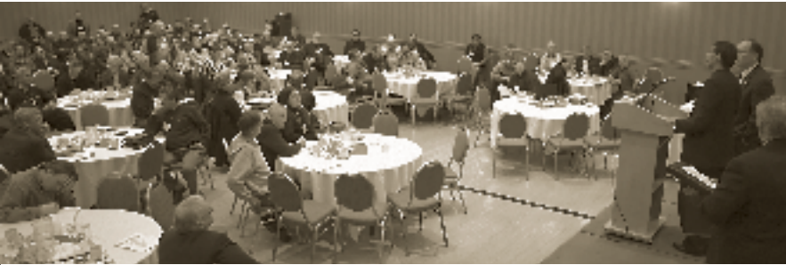
The Honourable Minister Mark Wartman addresses delegates at 2005 Flax Day